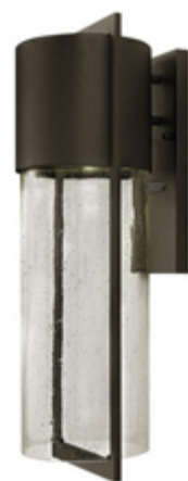
Shelter Outdoor Wall Sconce by Hinkley Lighting