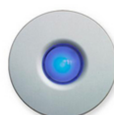
De-light Doorbell Button by Spore