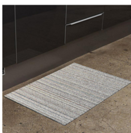
Skinny Stripe Shag Indoor/Outdoor Mat by Chlewich