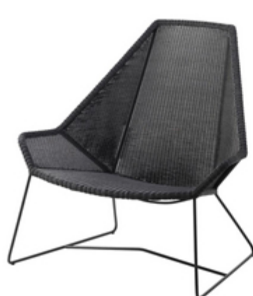
Breeze Highback Chair by Cane-line