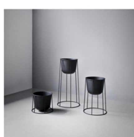
Wire Plant Pot by Menu